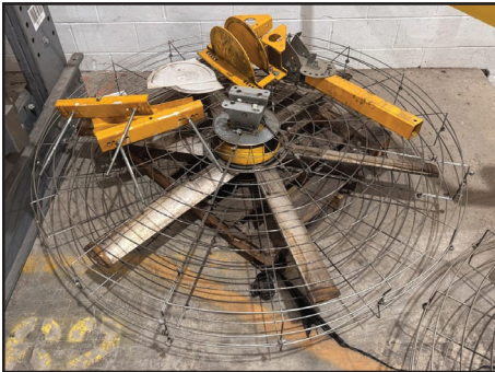
1 OF 4 BIG ASS FAN 6' INDUSTRIAL FAN