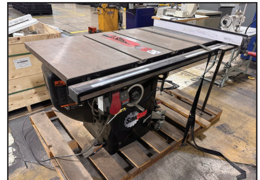
SAWSTOP PCS 3120 10" PROFESSIONAL CABINET SAW