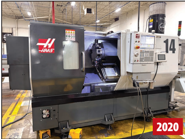
1 OF 5 HAAS DS-30Y TURNING CENTER