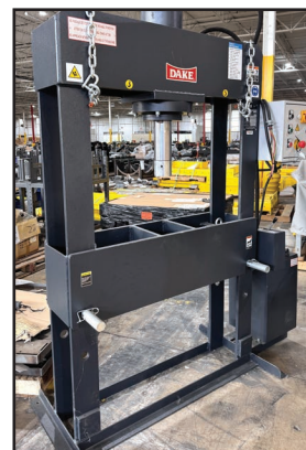
2018 DAKE PSS 70 HYD. H-FRAME SHOP PRESS

PRE-AUCTION OFFERS INVITED ON MAJOR ASSETS