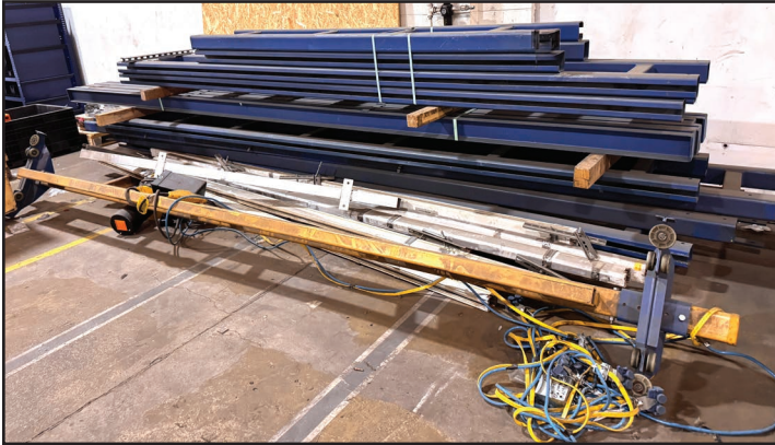
GORBEL 2-TON FREE STANDING BRIDGE CRANE

ALSO: Cantilever Racking, Assortment of COLUMBIA and ORACLE Commercial Lighting, Transformers, Dump Hoppers, Shop Carts, and More