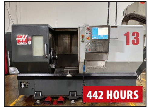
2014 HAAS ST-30 TURNING CENTER