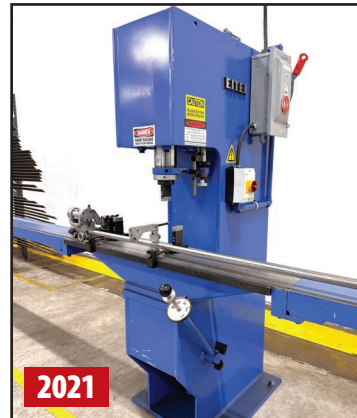
1 OF 2 MAE-EITEL RP-16 STRG. PRESS