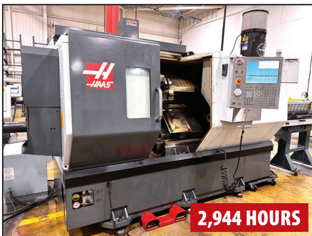
2012 HAAS DS-30 TURNING CENTER