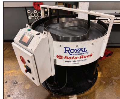
1 OF 2 ROYAL ROTA-RACK PARTS ACCUMULATOR