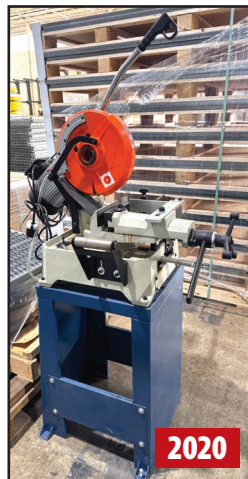
BAILEIGH CS-250EU 10" COLD SAW