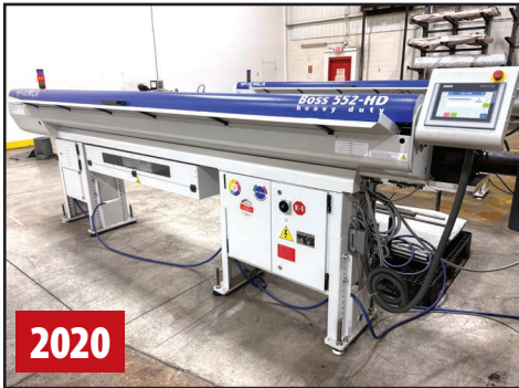
1 OF 5 IEMCA BOSS 552-HD BAR FEEDER