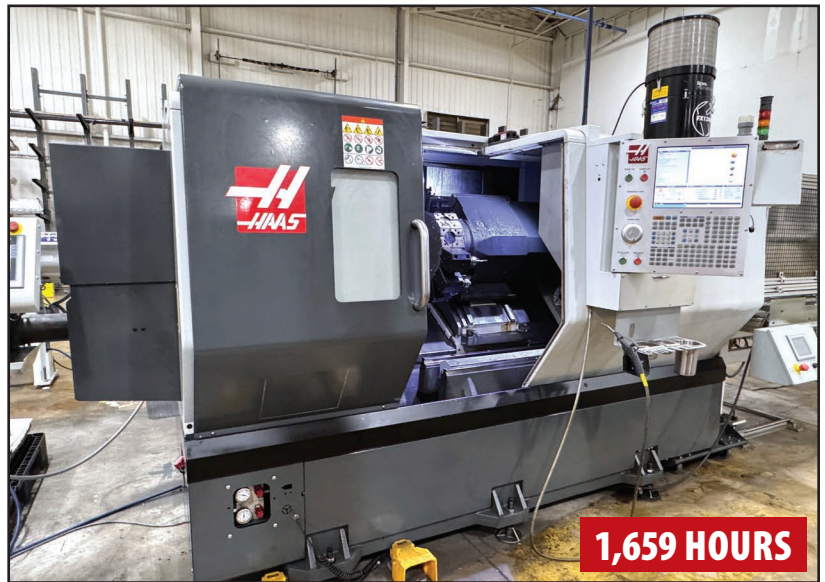
2021 HAAS DS-30Y TURNING CENTER

(5) TOELLNER SYSTEMS UNLOADERS, s/n na, w/ Touch PLC Control