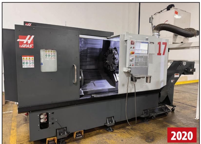
1 OF 8 HAAS ST-30 TURNING CENTER