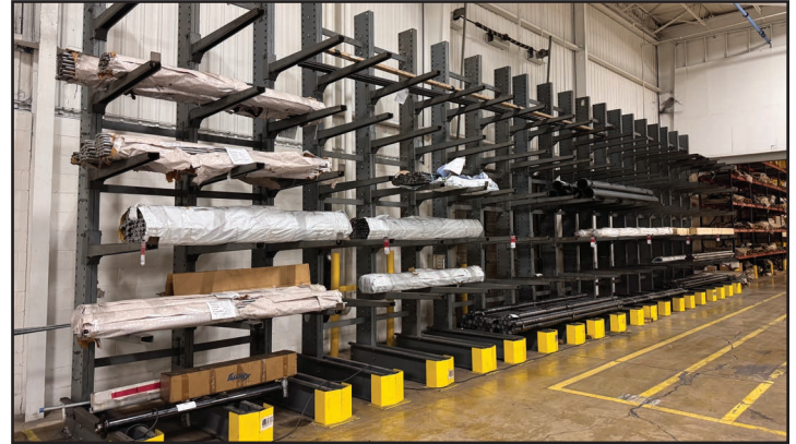
VIEW OF CANTILEVER RACKING