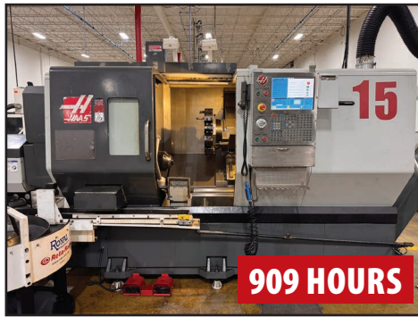
2015 HAAS ST-30 TURNING CENTER