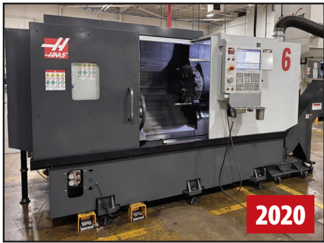
1 OF 8 HAAS ST-30 TURNING CENTER