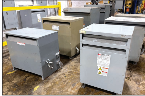
VIEW OF TRANSFORMERS