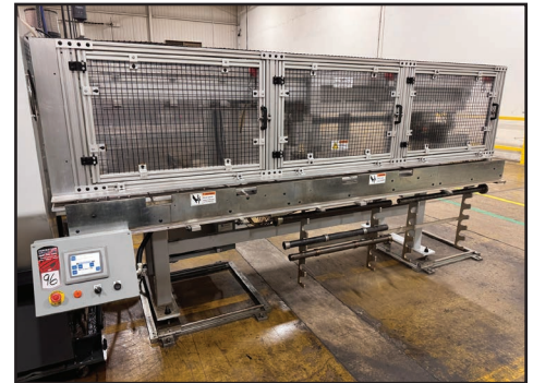
1 OF 5 TOLLNER SYSTEMS UNLOADER