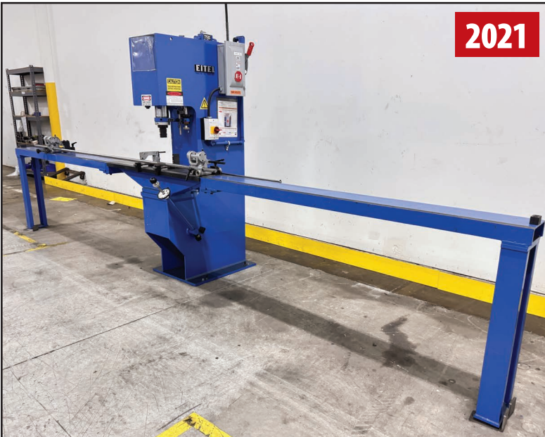
1 OF 2 MAE-EITEL RP-16 STRAIGHTENING PRESS

2018 DAKE PSS 70 HYDRAULIC H-FRAME SHOP PRESS, s/n 7875, 70-Ton Capacity, 19.7" Stroke, 47 IPM Approach Speed, 5 IPM Working Speed