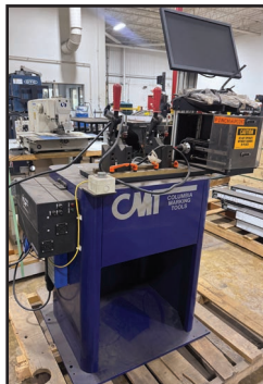
COLUMBIA MARKING TOOLS I-MARK MARKING MACHINE