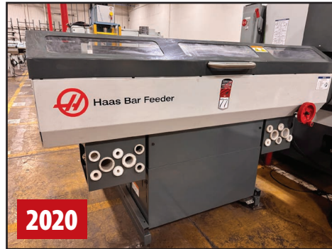
HAAS BAR FEEDER