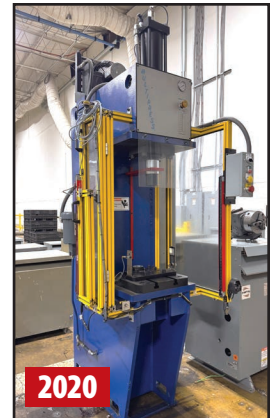
MULTIPRESS M5P-20F HYD. PLC PRESS