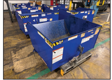
VIEW OF DUMP HOPPERS

For auction inquiries, please contact Jennifer Reiner at (847) 545-6374 or jennifer@perfectionindustrial.com