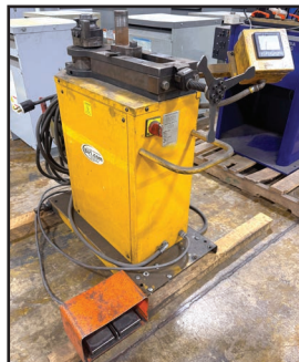
BAILEIGH M250 TUBE BENDER