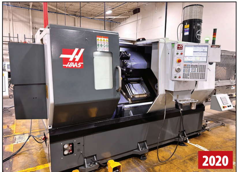
1 OF 5 HAAS DS-30Y TURNING CENTER