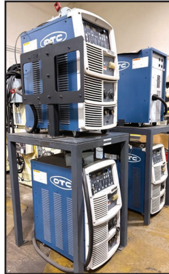
VIEW OF OTC WB-P400 WELDING POWER SOURCES

ALSO: BAILEIGH 10' Tube Bender Indexer, (2) ROYAL Rota-Rack Parts Accumulators, FLEXARM Pneumatic Tapping Arms, Sewing Machines, Belt Finisher