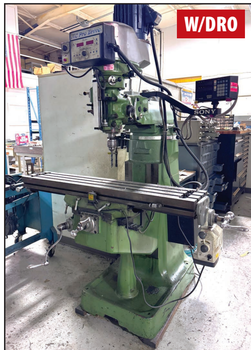
TOP-ONE 3 HP VERTICAL MILL

ALSO: BRIDGEPORT Series I 2 HP Mill Head, HAAS 8" Rotary Table, KURT 688 6" Machine Vises, CAT 40 Tool Holders, End Mills, Drills, Taps, Reamers, Chucks, Collets, Drill Press Vises, Grinding Vises, Magnetic Chucks, Sine Plates, Radius Dressers, EDM Tooling from System 3R and IMEA ISTEMA