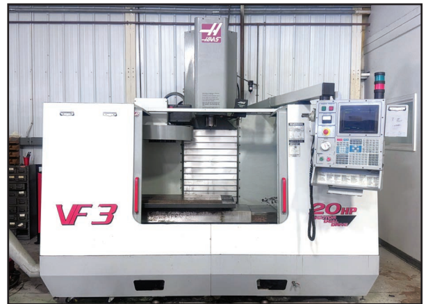
HAAS VF-3 VERTICAL MACHINING CENTER