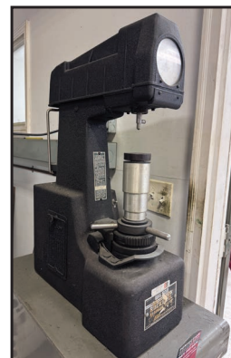
WILSON 3JS ROCKWELL HARDNESS TESTER