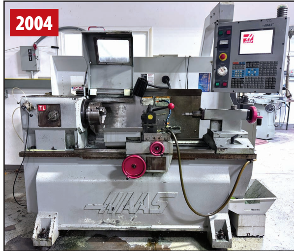
HAAS TL-1 CNC LATHE

HAAS VF-3 VERTICAL MACHINING CENTER , s/n 23760, w/ Haas CNC Control, X-40", Y-20", Z-25", CAT 40 Spindle Taper, 20-ATC, 18" x 48" Table, 3500 lb. Table Capacity, 20 HP Vector Drive