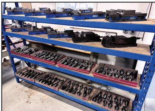
VISES & TOOL HOLDERS

PRE-AUCTION OFFERS INVITED ON MAJOR ASSETS