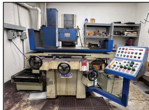
PERFECT PFG-3060AH SURFACE GRINDER