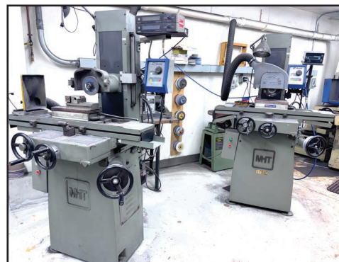
(2) MHT MSG-200MH SURFACE GRINDERS