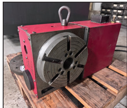
HAAS 8" ROTARY TABLE