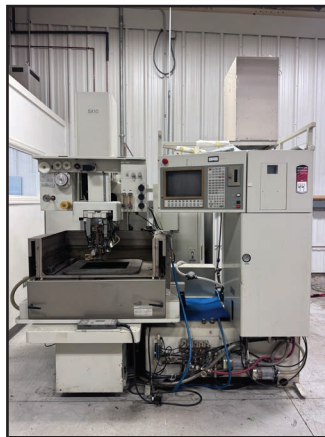
MITSUBISHI SX10 WIRE EDM

MITSUBISHI SX10 WIRE EDM , s/n 57X10451, w/ Mitsubishi CNC Control, X-13.8", Y-9.8", Z-8.6", 1.25" U/V, 23.2" x 20.2" Table, 1,168 lb. Table Capacity, 31.5" x 22.6" x 8.5" Work Tank