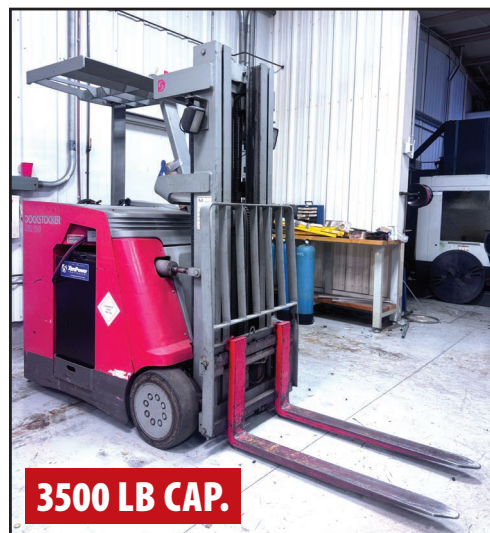
RAYMOND DOCKSTOCKER DSS 350 ELECTRIC STANDUP FORKLIFT