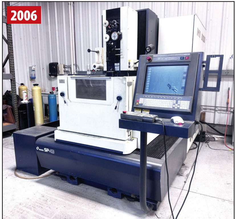
MAKINO SP43 WIRE EDM