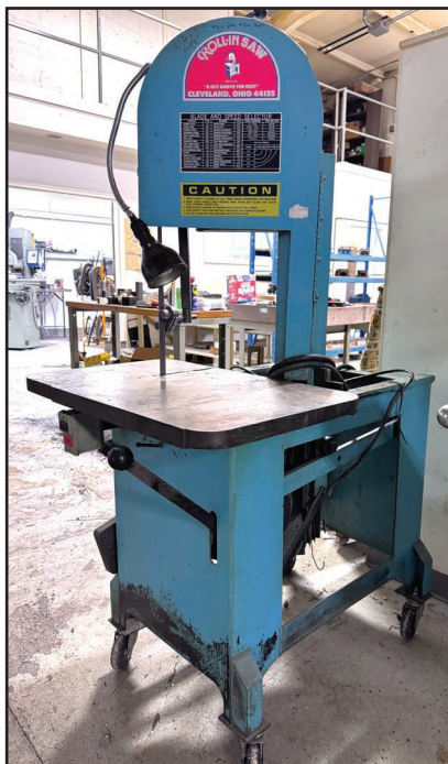
ROLL-IN SAW VERTICAL BAND SAW