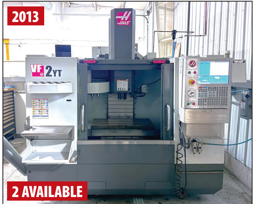
HAAS VF-2YT VERTICAL MACHINING CENTER