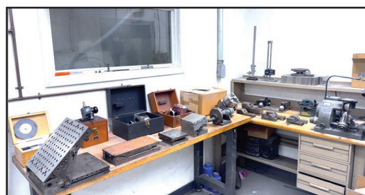
VIEW OF INSPECTION ROOM