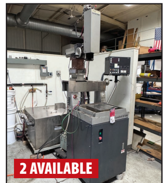
ELENIX ST300 EDM DRILL