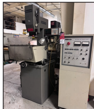
HANSVEDT 201 SINKER EDM

ELENIX ST300 EDM DRILL (PARTS MACHINE) , s/n 83182, w/ Elenix Control, X-12", Y-8", Z-12", 12" x 12" Table, 682 lb. Max. Workpiece Weight, 18" x 16" Work Tank