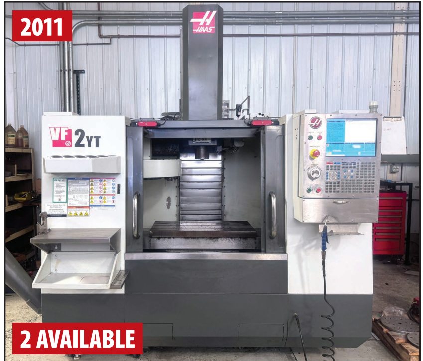
HAAS VF-2YT VERTICAL MACHINING CENTER

2004 HAAS TL-1 CNC LATHE , s/n 66860, w/ Haas CNC Control, 8" 3-Jaw Chuck, 16" Max. Swing Over Bed, 30" Max. Cutting Length, 8.5" Max. Swing Over Cross Slide, 2.3" Spindle Bore, DORIAN Quick Change Tool Post w/ Assorted Quick Change Tool Holders, Tailstock