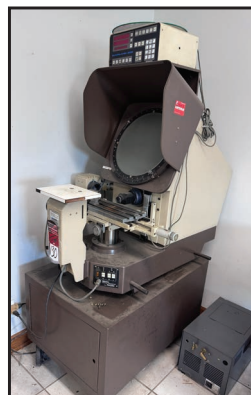
MITUTOYO PH-350 PROFILE PROJECTOR

ALSO: Pedestal Grinders, Bench Grinders, Belt/Disc Sanders, Modular Tool Cabinets, Rolling Tool Chests, Steel Tables, Power Tools, Hand Tools, Air Tools, C-Clamps, KANT TWIST Clamps, Shop Carts, Hardware Organizers, Anti-Fatigue Floor Mats, Lifting Slings, Eye Bolts, Chain, Hoist Rings, Nylon Straps, and more