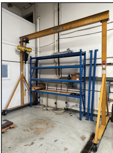
SPANCO 2-TON ROLLING GANTRY CRANE