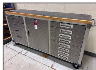
ROLLING TOOL CHEST