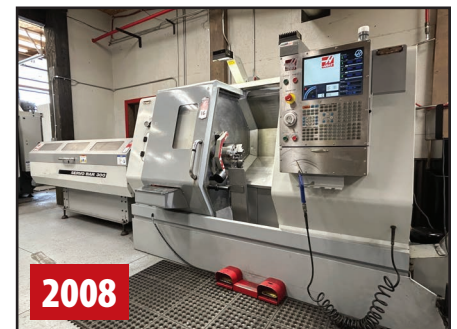
HAAS TL-15 TURNING CENTER