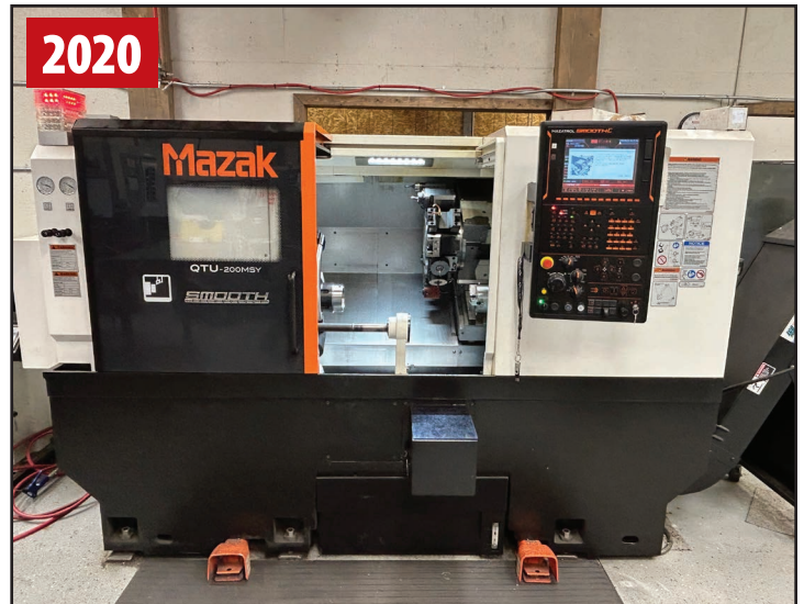
MAZAK QTU-200MSY TURNING CENTER