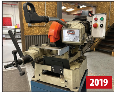
BAILEIGH CS-250EU COLD SAW