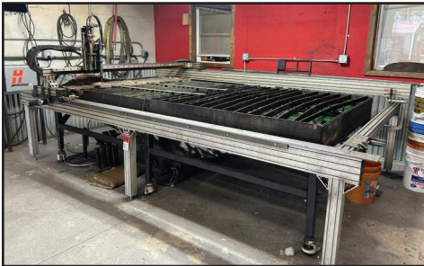
TORCHMATE 5X10 PLASMA CUTTER