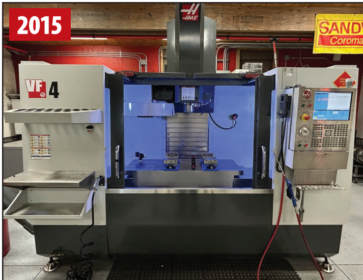
HAAS VF-4 4-AXIS VERTICAL MACHINING CENTER