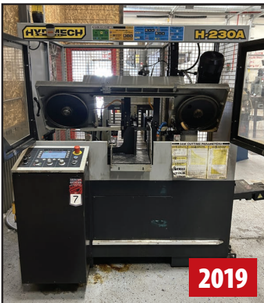
HYD-MECH H-230A AUTO. HORIZONTAL BANDSAW