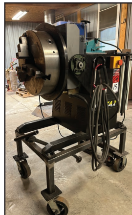
PROFAX WP-500 WELD POSITIONER