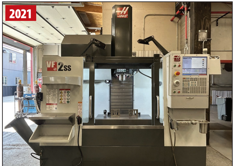
HAAS VF-2SS VERTICAL MACHINING CENTER

FEATURING: 2021 HAAS VF-2SS VMC, 2015 HAAS VF-4 4th Axis VMC, 2020 MAZAK QTU-200MSY Turning Center, 2008 HAAS TL-15 Turning Center, 2020 ATS ML-580 CNC Barfeed, 2008 HAAS Servo Bar 300 Barfeed, VULCAN 49-40A VTL, LEBLOND 9" Oil Country Lathe, TARNOW Gap Bed Engine Lathe, 2007 OMAX 55100 JetMachining Center Waterjet, 2019 HYD-MECH H-230A Auto. Horizontal Band Saw, 2019 BAILEIGH CS-250EU Cold Saw, MILLER Dynasty 350 Tig Welder, 2022 MILLER Filtair SWX-D Fume Extractor, TORCHMATE 5 X 10 Plasma Cutter, PROFAX WP-500 Weld Positioner, GIDDINGS & LEWIS BICKFORD Chipmaster Radial Arm Drill, and More!