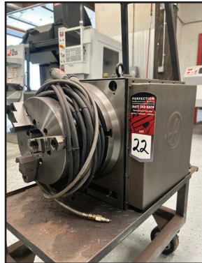
HAAS 4TH AXIS ROTARY TABLE

2008 HAAS TL-15 TURNING CENTER, s/n 3080823, Full C-Axis, 20 HP Vector Dual Drive, w/ Kitagawa B-210 10" 3-Jaw Chuck, 2008 HAAS Servo Bar 300 Bar Feeder, s/n 92630 (Offered Separately)