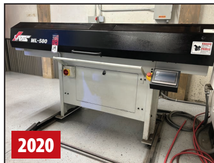
ATS ML-580 CNC BAR FEEDER