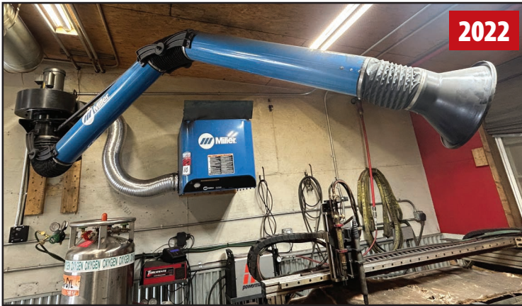
MILLER FILTAIR SWX-D FUME EXTRACTOR

ALSO: ROYAL Quick Change Collets, RENISHAW Probe, Chucks, CAT 40 Tool Holders and Tooling, Fixture Clamps, Vises, Machine Skates, and more!