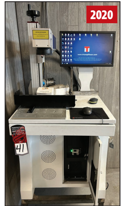
TRIUMPH TR-F20MS 30W FIBER MARKING LASER