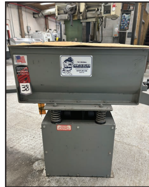
C&M TOPLINE MR. DEBURR DB300 VIBRATORY FINISHER