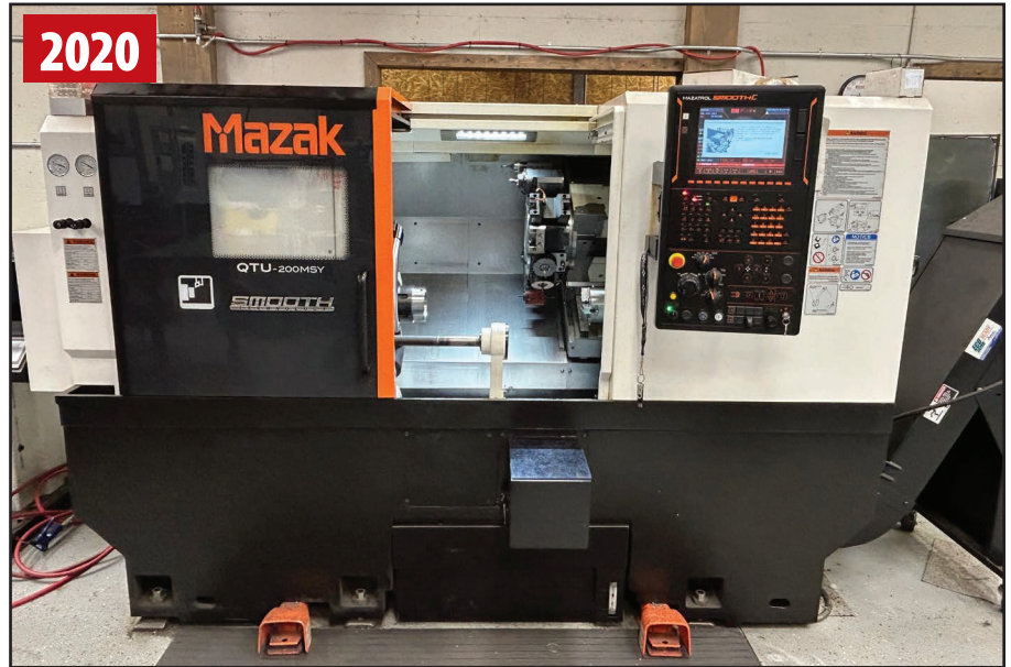
MAZAK QTU-200MSY TURNING CENTER