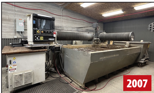
OMAX 55100 JETMACHINING CENTER CNC WATERJET

ABRASIVE WATERJET / EBBCO CLS-141-SWS-UNIVERSAL CNC WATERJET CLOSED LOOP FILTRATION SYSTEM, s/n J-9869