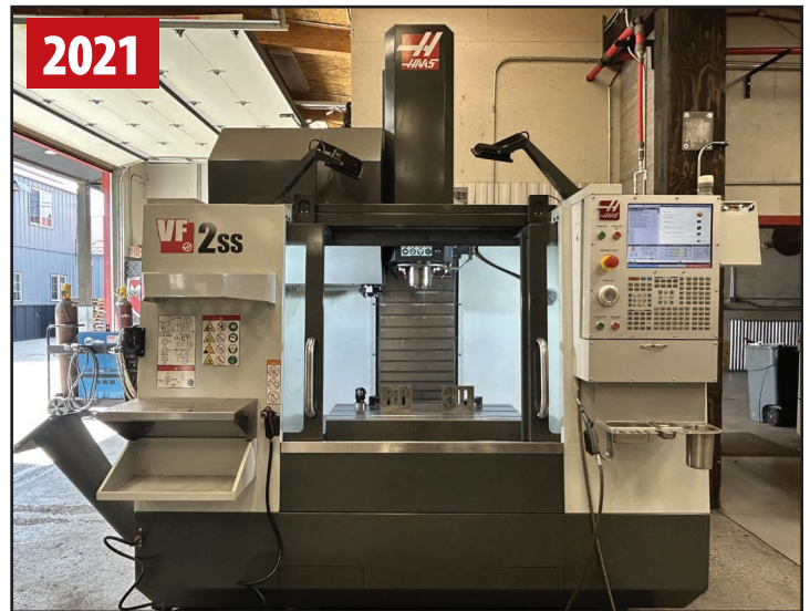
HAAS VF-2SS VERTICAL MACHINING CENTER