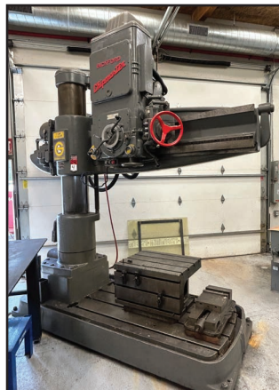
G&L BICKFORD CHIPMASTER 953 RADIAL ARM DRILL