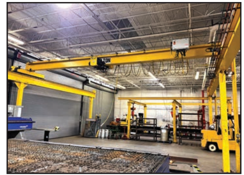
R&M 5 TON FREE STANDING BRIDGE CRANE

(2) EARTH-CHAIN ELM-1000 PERMANENT LIFTING MAGNETS , w/ 2,200 lb. Capacity