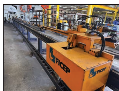
FICEP HP 20 T6 CNC ANGLE PUNCH & SHEAR LINE