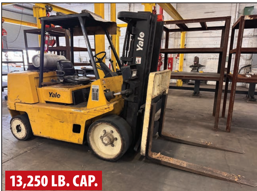
YALE LPG FORKLIFT