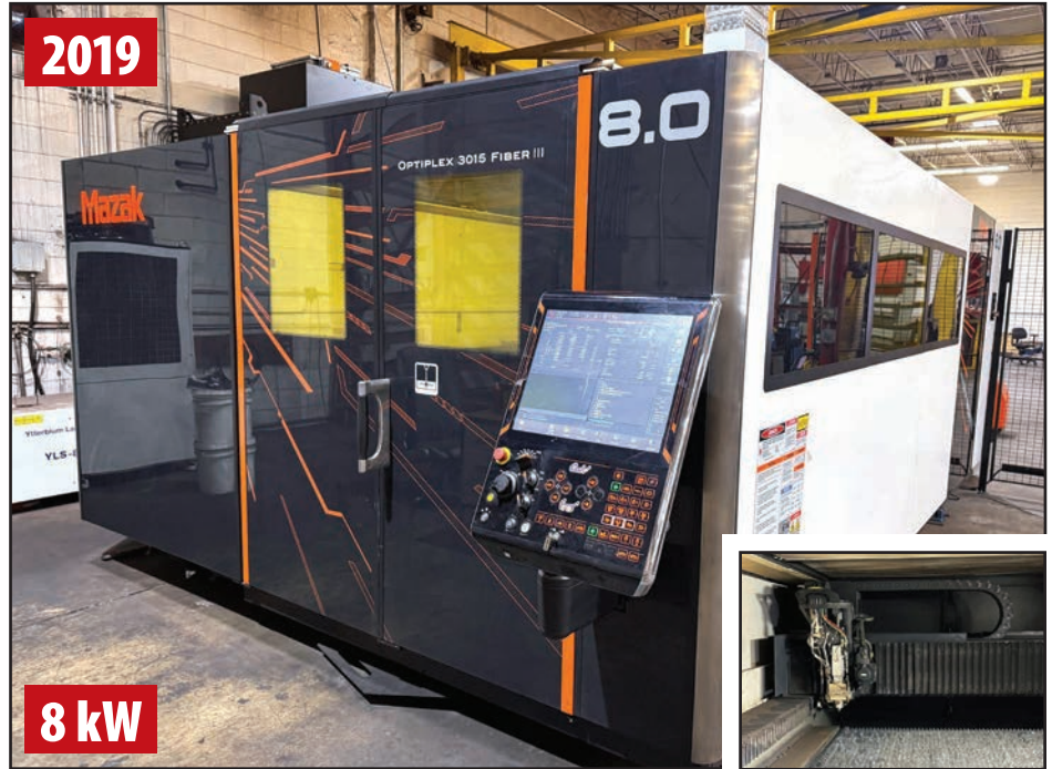
MAZAK OPTIPLEX 3015 FIBER III CNC FIBER LASER