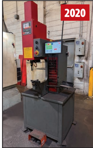
HAEGER 6 TON INSERTION PRESS