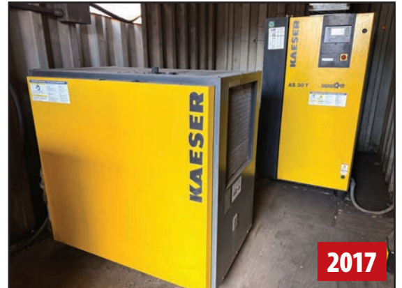
KAESER 30 HP ROTARY SCREW COMPRESSOR & DRYER