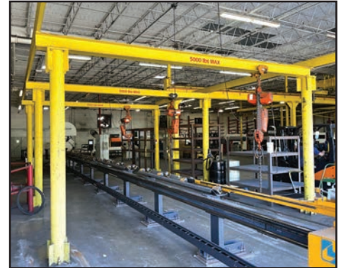
TRI-BRIDGE FIXED GANTRY SYSTEM