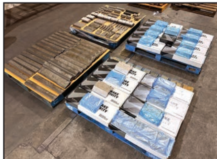
VIEW OF WILA AMERICAN STYLE & STANDARD BRAKE DIES

Large Selection of WILA American Style Press Brake Dies , Standard Press Brake Dies, WILA Die Cabinet and Die Racks