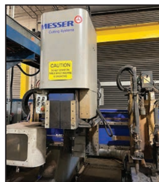
MESSER DRILL UNIT, PLASMA & OXY HEADS