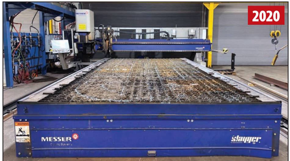
MESSER MPC 2000 CNC MULTI-PROCESS CENTER

FEATURING: (2) 2019 & 2017 MAZAK OPTIFLEX 3015 FIBER III 8 KW LASERS, 2022 SENFENG SF6020NT 6 KW PIPE FIBER LASER CUTTING MACHINE, 2020 MESSER MPC2000 MULTI-PROCESS CUTTING SYSTEM W/ DRILL, OXY, & PLASMA TORCH + SLAGGER M12X21 TABLE, 2020 FICEP 8"X 8"X 1" CNC ANGLE PUNCH & SHEAR LINE, 2023 ACCURPRESS ACCELL 250 TON X 12' CNC BRAKE, 2012 ACCURPRESS 150 TON X 10' CNC BRAKE, NEW WILA BRAKE TOOLING, 2020 HAEGER INSERTION MACHINE, PIRANHA 110 TON IRONWORKER, (2) HYD-MECH BAND SAWS, (20) MILLER & LINCOLN WELDERS, FREE-STANDING CRANES UP TO 5 TON CAPACITY, FORKLIFTS, COMPRESSORS, AND PLANT SUPPORT