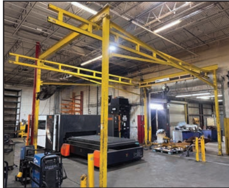
SPANCO 1 TON FREE STANDING CRANE SYSTEM