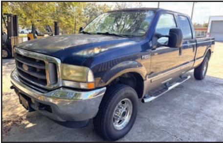
2003 FORD SUPER DUTY F-250 LARIAT PICK UP

ALSO: Toolboxes, Mag Drills, Air Tool, Power Tools, Hand Tools, Grinders, Carbide Inserted Drills, Twist Drills, End Mills, Taps, Collets, Machine Vises, Bench Vises, Outside Micrometers, Depth Gauges, Granite Surface Plate, Rigging Skates, Plate Lifting Clamps, Come-A-Longs, Shackles, Cantilever Racking, Pallet Racking