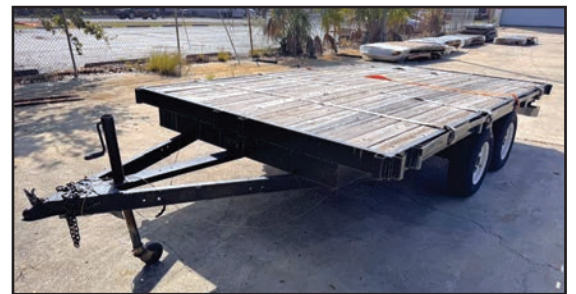
FLAT DECK TRAILER

For auction inquiries, please contact Jennifer Reiner at (847) 545-6374 or jennifer@perfectionindustrial.com