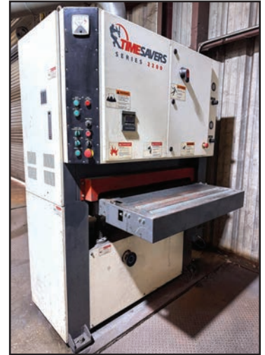
TIMESAVERS 37" WIDE BELT SANDER