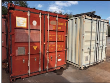
VIEW OF CONTAINERS