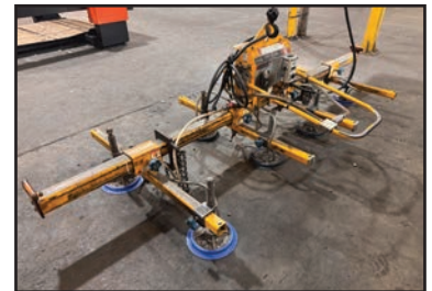
ANVER ELECTRIC VACUUM SHEET LIFTER

YALE GLC050RGNUAE084 4,800 LB. LPG FORKLIFT , s/n E187V23788B, w/ 194.9" 3-Stage Mast, Side Shifter, 42" Fork Length, (Not in Running Condition)