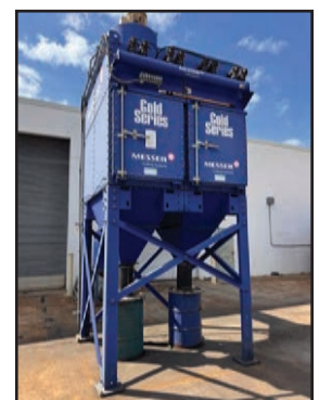
MESSER FUME FILTER EXHAUST SYSTEM