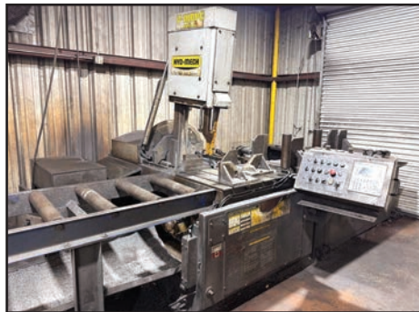
HYD-MECH V-18APC VERTICAL BAND SAW

ALSO: Tabletop Welding Positioners, C-Clamps, Bar Clamps, Quick Grip Clamps, Torch Carts