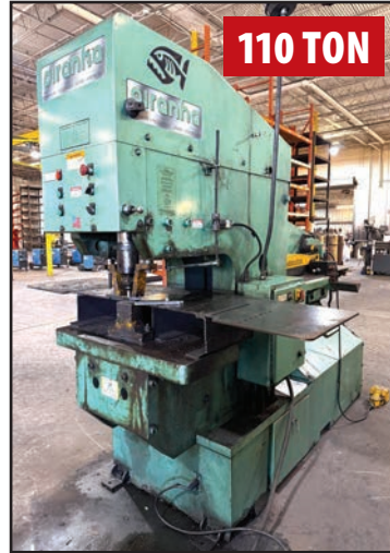
PIRANHA PII110 IRONWORKER