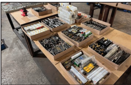
VIEW OF TOOLING