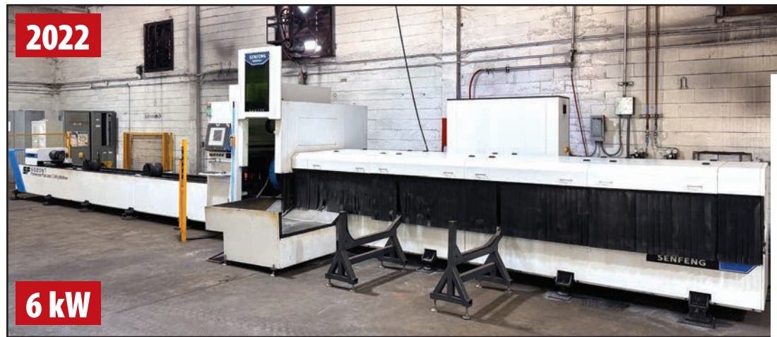
SENFENG SF6020NT CNC TUBE FIBER LASER