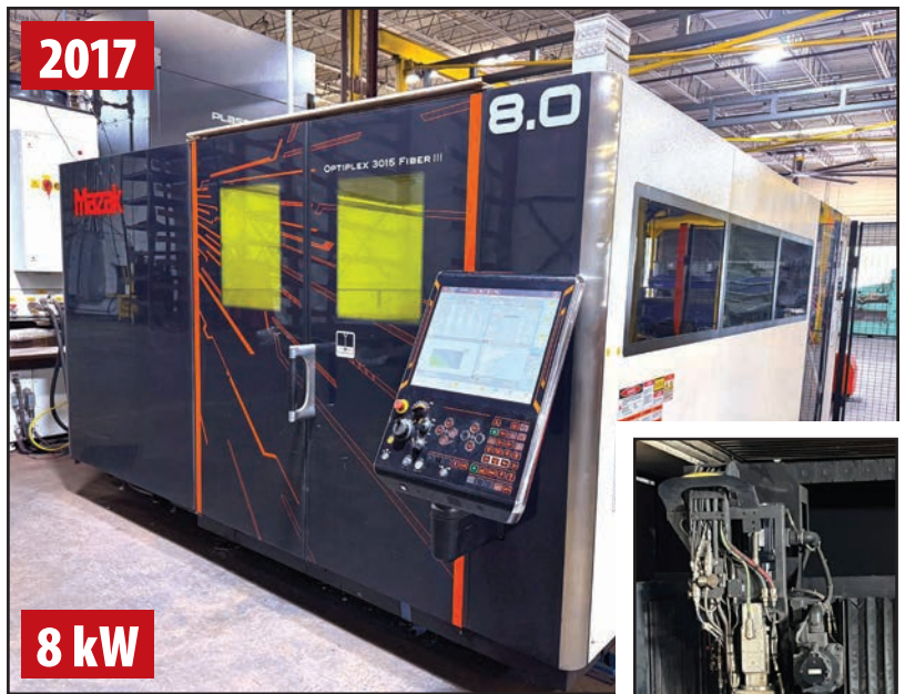
MAZAK OPTIPLEX 3015 FIBER III CNC FIBER LASER

2022 SENFENG SF6020NT CNC 6 KW TUBE FIBER LASER , s/n 202204124, w/ CNC Control, RAYCUS RFL-C6000X 6KW Fiber Power Source, 2D Cutting Head, 262 FPM Max. Cutting Speed, 100 RPM Max. Rotational Speed, Auto Loading, 20' Infeed, 14' Outfeed, Chiller, Dust Collector