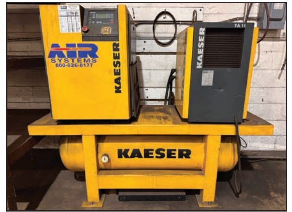
KAESER SM11 10 HP ROTARY SCREW COMPRESSOR/DRYER