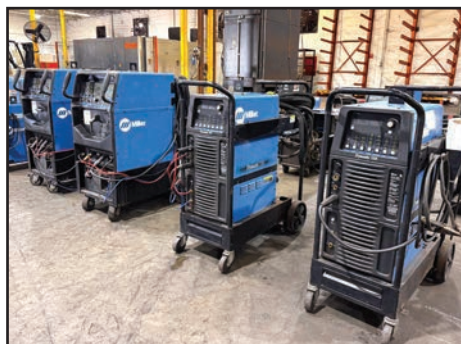
VIEW OF WELDERS