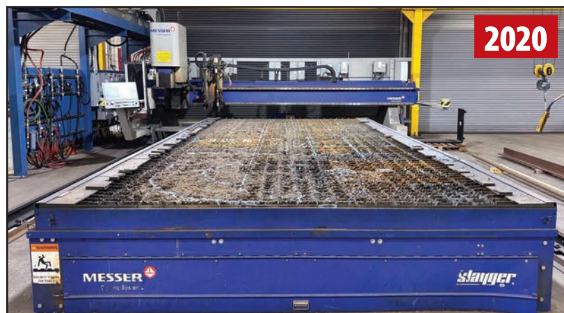
MESSER MPC 2000 CNC MULTI-PROCESS CENTER

2020 MESSER MPC 2000 CNC MULTI-PROCESS CENTER , s/n MPC2016-20-6831, w/ MESSER GLOBAL Control Plus w/ 24" Touch Screen, SLAGGER M12X21 System w/ Pendant Remote Control, 12' x 21' Cutting Table, s/n T-6615-47001208, HYPERTHERM XPR400 Plasma Unit, (1) Plasma Straight Cut Cutting Head, (1) Oxy Cutting Torch, (1) 36 HP CAT 40 Drill Head w/ 12-Station ATC, 2"Ø Drill Capacity, MESSER GOLD SERIES GS16 X-Flo 20 HP Fume Filter Exhaust System