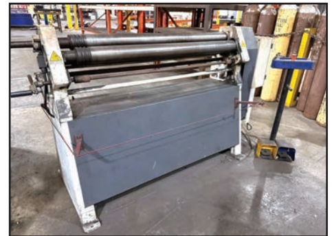
FAMAR 52" X 1/8" POWER SLIP ROLL