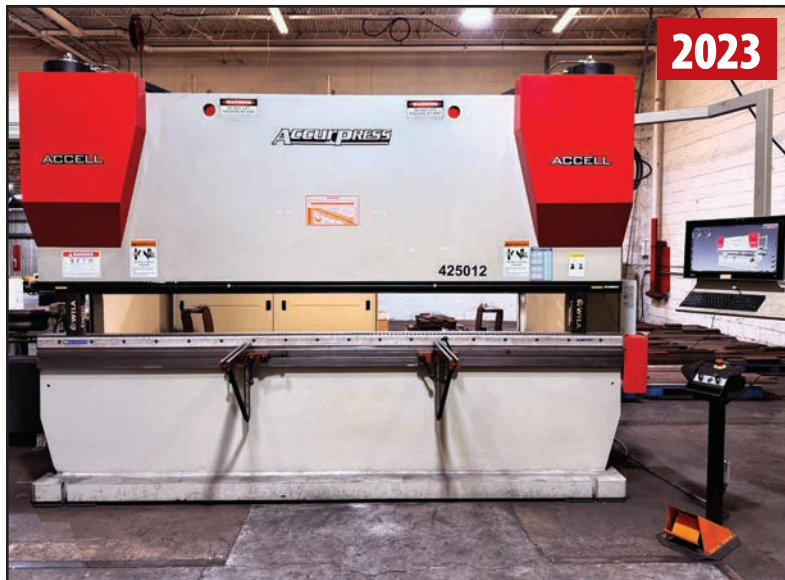
ACCURPRESS 250 TON X 12' CNC BRAKE

2012 ACCURPRESS 515010 150 TON X 10' CNC PRESS BRAKE , s/n 11112, w/ BECKHOFF Control, 10'6" Between Housings, Back Gauge, WILA American Style Power Ram Tool Clamping, Electric Foot Switch Control, (2) Front Support Arms, Flush Floor