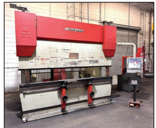
2012 ACCURPRESS 150 TON X 10' CNC BRAKE