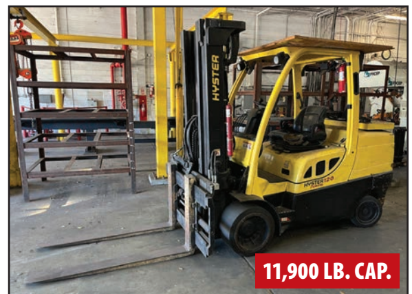
HYSTER LPG FORKLIFT