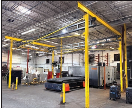
SPANCO 1 TON FREE STANDING CRANE SYSTEM