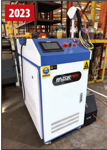
RAZORTEK RZ2000H FIBER LASER

TRUMP K2V 3 HP VERTICAL MILL, s/n K2V-2366, w/ 9" x 42" Power Feed Table, 70-4200 RPM Spindle Speed, Power Quill Feed, ACU-RITE DRO