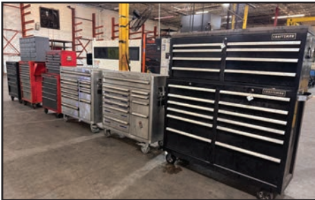
VIEW OF TOOL CHESTS