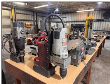
VIEW OF POWER TOOLS