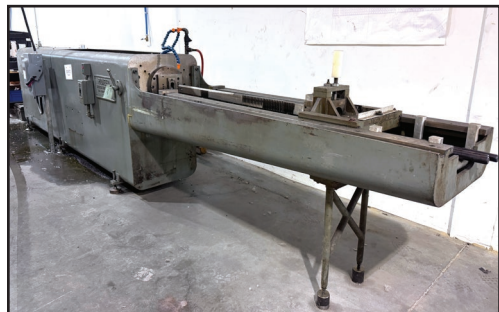
PIONEER H-1560A HORIZONTAL BROACH

PIONEER H-1560A HORIZONTAL BROACH , s/n A-1619, 15 Ton Capacity, 60" Max. Stroke, 25 FPM Cutting Capacity, 50 RPM Return, 23" Max. Workpiece Dia, 10" Bore in Worktable, 1,800 RPM, 30 HP