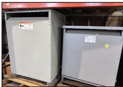
TRANSFORMERS UP TO 225 KVA