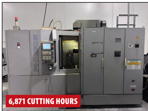
TOYODA FH450S 4-AXIS HMC—SIDE VIEW