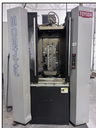
TOYODA FH450S 4-AXIS HMC—FRONT VIEW

2007 HARDINGE GS 200/66 TURNING CENTER , s/n BLEA7G0015, w/ Fanuc Oi-TC Control, 14.02" Max. Machining Dia, 23.6" Max. Machining Length, 35 HP, 4,200 Max. RPM, 23.4" Swing Over Cross Slide, 12-Station Turret, X-10.7", Z-23.5", 1,181 IPM X/Z Traverse Rates, Collet Chuck, Tailstock, Chip Conveyor