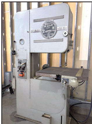
DOALL 26 VERTICAL BAND SAW