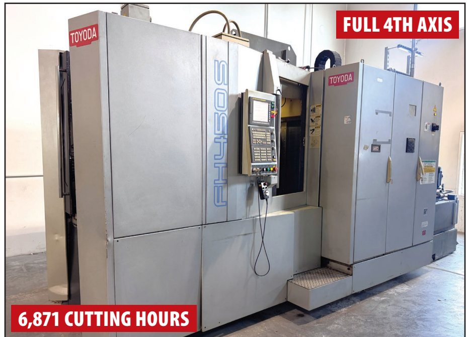
TOYODA FH450S HORIZONTAL MACHINING CENTER

FEATURING: 2007 TOYODA FH450S HMC, 2006 HYUNDAI KIA SKT21LMS TURNING CENTER, (2) 2007 HARDINGE GS-250L TURNING CENTERS, 2007 HARDINGE GS 200/66 TURNING CENTER, SUNNEN STH-2000LJEM-074 HORIZONTAL HONE, PIONEER H-1560A HORIZONTAL BROACH, CONVENTIONAL MACHINE TOOLS, 2009 ELECTROX FLEXYZ LASER MARKING SYSTEM, SUNNEN DCM MPI 4562 MAGNETIC PARTICLE INSPECTION SYSTEM, 2008 ELBO CONTROLLI SETHY-306 TOOL PRESETTER, TRANSFORMERS, TOOLING, GRANITE WORK TABLES, AND MORE.