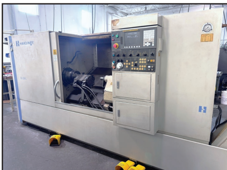
HARDINGE GS-250L TURNING CENTER