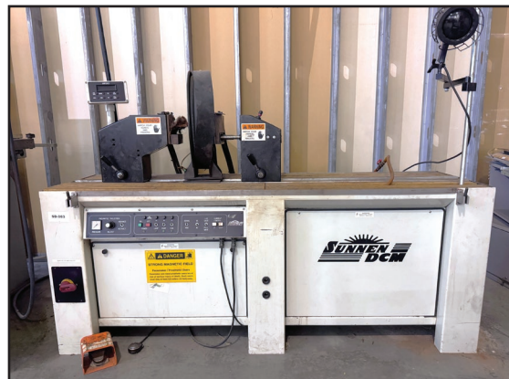
SUNNEN DCM MPI 4562 MAGNETIC PARTICLE INSPECTION SYSTEM

2008 ELBO CONTROLLI SETHY-306 TOOL PRESETTER , s/n 4341, 40 Taper