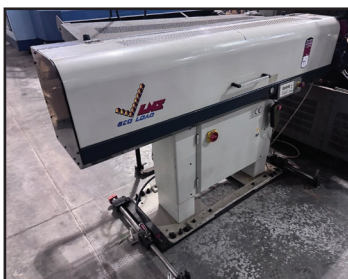
LNS ECO-LOAD L BAR FEED