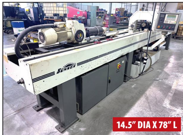
SUNNEN STH-2000LJEM-074 HORIZONTAL HONE