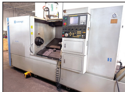
HARDINGE GS-250L TURNING CENTER