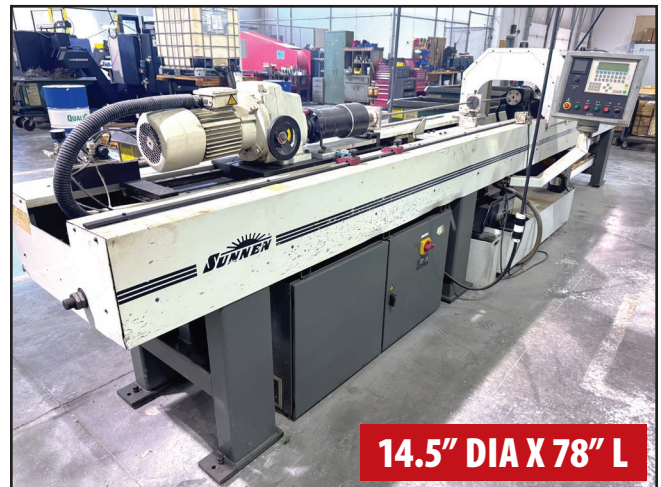
SUNNEN STH-2000LJEM-074 HORIZONTAL HONE

FEATURING: 2007 TOYODA FH450S HMC, 2006 HYUNDAI KIA SKT21LMS TURNING CENTER, (2) 2007 HARDINGE GS-250L TURNING CENTERS, 2007 HARDINGE GS 200/66 TURNING CENTER, SUNNEN STH-2000LJEM-074 HORIZONTAL HONE, PIONEER H-1560A HORIZONTAL BROACH, CONVENTIONAL MACHINE TOOLS, 2009 ELECTROX FLEXYZ LASER MARKING SYSTEM, SUNNEN DCM MPI 4562 MAGNETIC PARTICLE INSPECTION SYSTEM, 2008 ELBO CONTROLLI SETHY-306 TOOL PRESETTER, TRANSFORMERS, TOOLING, GRANITE WORK TABLES, AND MORE.