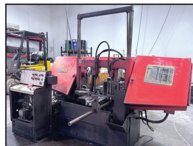
W.F. WELLS F15 HORIZONTAL BAND SAW

ALSO: CAT 40 Tool Holder, BT 40 Tool Holders, HUOT Tooling Carts, Machine Vises, Bench Vises, Speed Vises, Sine Plates, Magnetic Chucks, R8 Collets and Tooling, C5 Collets, RENISHAW OMP60 Probe, Turret Tooling, Live Tooling, Chuck Jaws, Drill Chucks, Centers, KALAMAZOO Belt Sanders, Parts Washers, Granite Surface Plates, C-Clamps, Vise Grip Clamps, KANT-TWIST Clamps, Work Benches and More