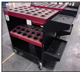
HUOT TOOL CARTS