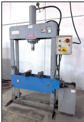
DAKE 40-TON HYD. H-FRAME SHOP PRESS