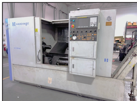
HARDINGE GS 200/66 TURNING CENTER