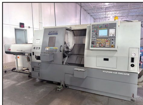
HYUNDAI KIA SKT21LMS TURNING CENTER