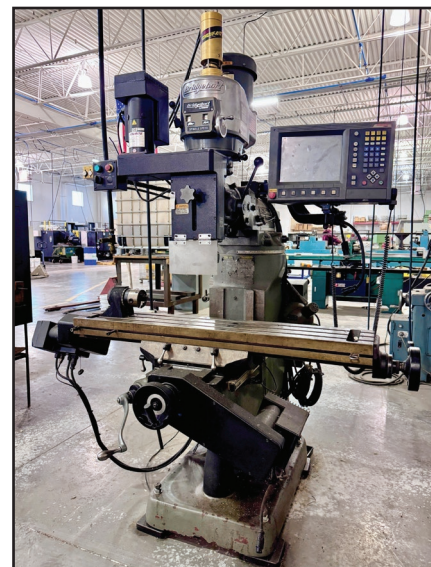
BRIDGEPORT HARDINGE EZ PLUS MILL

PRE-AUCTION OFFERS INVITED ON MAJOR ASSETS