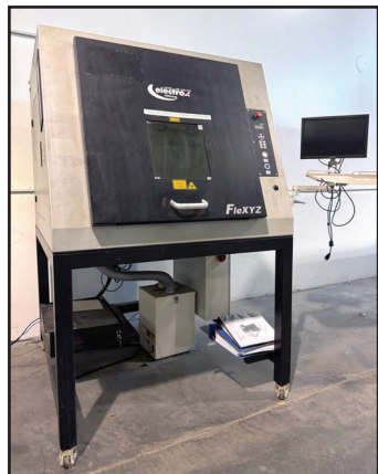
ELECTROX FLEXYZ LASER MARKING SYSTEM