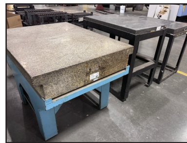
GRANITE SURFACE PLATES